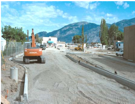
Hydraulic Analysis and Stormwater Plan, Oroville Shared Border Crossing, Oroville, Washington