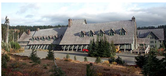
Drainage Improvements, Paradise Inn, Mt. Rainier National Park, Washington; Fletcher Farr Ayotte for the National Park Service