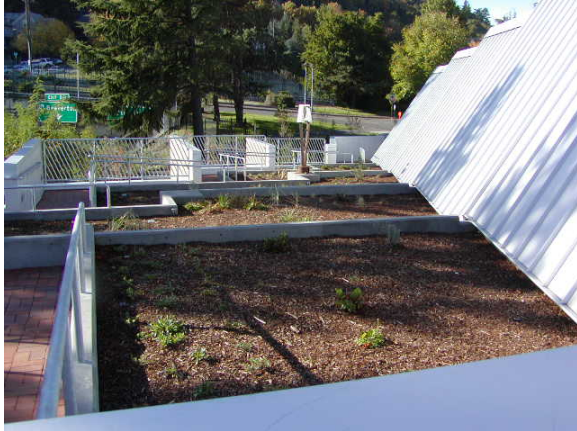
Innovative Stormwater Management, Native American Student and Community Center, Portland State University, Portland, Oregon; Stastny Brun Architects