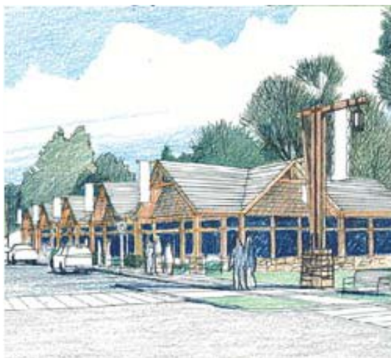
Warm Springs Downtown Plan, Confederated Tribes of the Warm Springs Reservation, Oregon