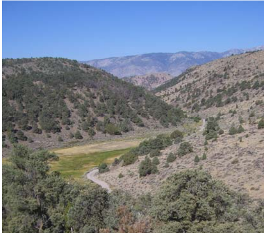
Land Use and Development Plan, Pine Nut, Nevada; Bureau of Indian Affairs, Western Regional Office