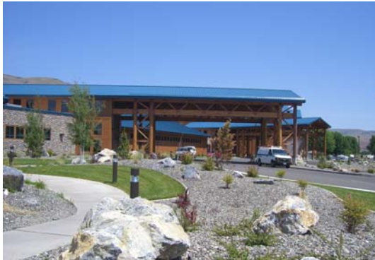
Clearwater River Casino, Nez Perce Tribe