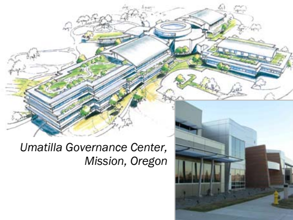
Umatilla Governance Center, Mission, Oregon