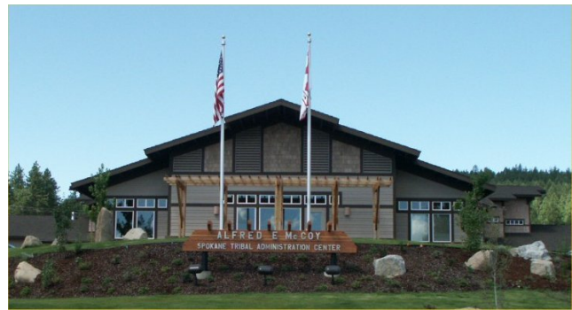
Spokane Tribal Administration Building, Wellpinit, Washington