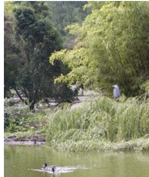
Laurelhurst Pond Sediment Management Project, City of Portland, Oregon