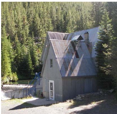
Bend Springs Water Supply Project, Brown & Caldwell for City of Bend, Oregon