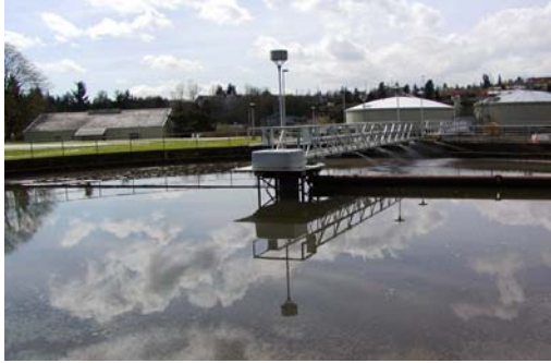
Wastewater Collection and Treatment Facilities Flexible Services Contract, City of Portland, Bureau of Environmental Services